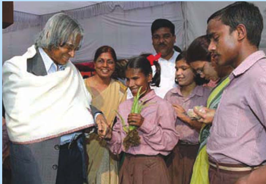
President with visually challenged children